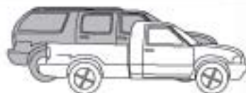
Full-Size Cars, Pickups, Vans, Utility Vehicles

▶ Class 3 Receiver W/ Weight Dist. Hitch